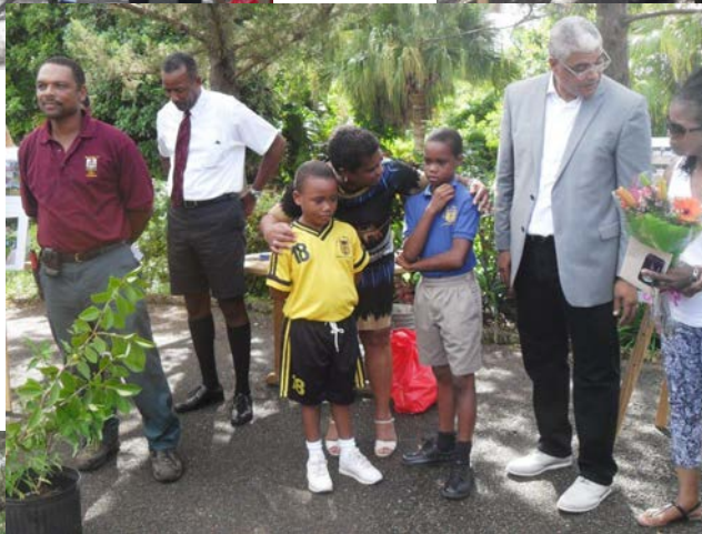
Two primary school students and Minister Patricia Gordon-Pamplin at the ribbon-cutting ceremony.