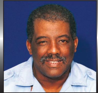
BY ALVIN WILLIAMS

two storms. We were able to depend on our Caribbean cousins who have sent linesmen to help put our system back together, but what if a hurricane sweeps through the Caribbean doing powerful damage to countries in the area and comes up to us to do the same damage? Remember, Gonzalo went all the way to England afflicting damage and three people lost their lives. In those circumstances our Caribbean cousins may not be in position to send help, having to deal with their own countries.