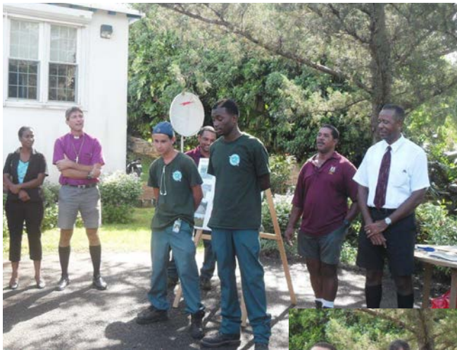
Two of the young men involved in the Horticulture Programme.